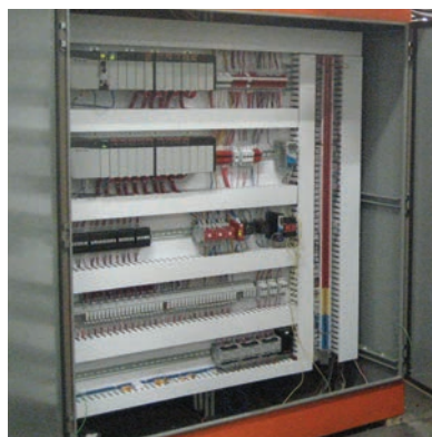
Allen-Bradley ControlLogix PLC