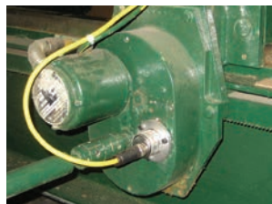
Absolute Position Encoders