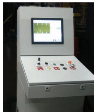
15" Color Touchscreen HMI